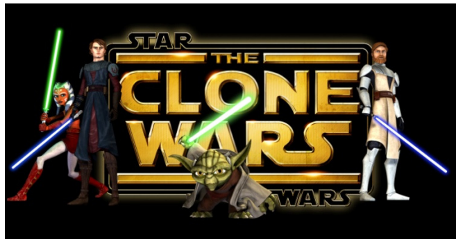
Star Wars: The Clone Wars